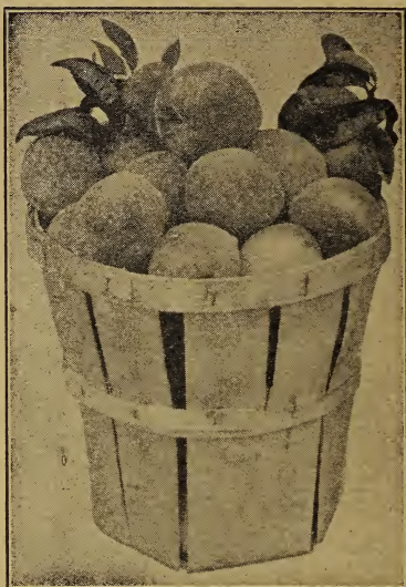
A Basket of Peaches